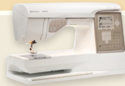
DESIGNER TOPAZ™ 30