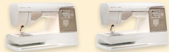
DESIGNER TOPAZ™ 30 DESIGNER TOPAZ™ 20