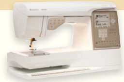
DESIGNER TOPAZ™ 20